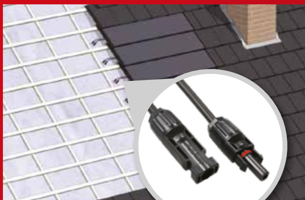
Tiles are supplied with simple to use standard "Plug In" MC4 connectors

The simple and quick installation makes the solar roof tile ideal for both new build and renovation projects.